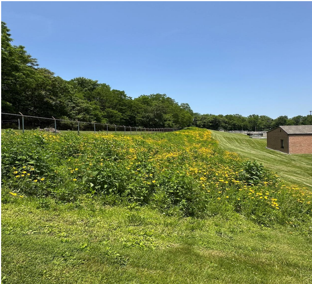
GC Lawn to Meadow Picture

Remnants of the SSO’s were cleaned up at the plants and reports were filed along with follow-up inspections by a PADEP inspector.